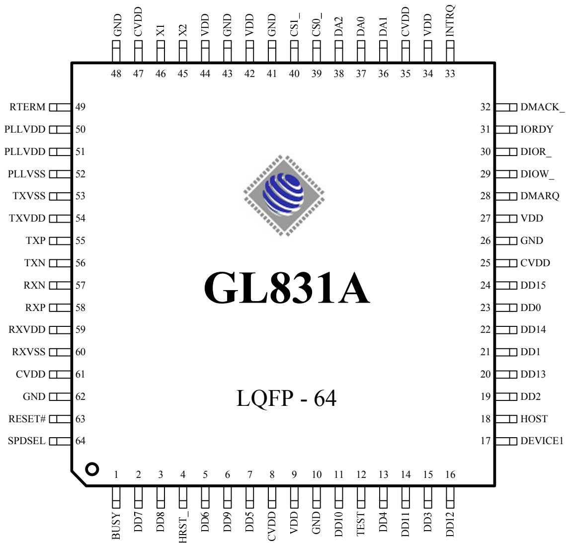
Figure 3.1 - 64 Pin LQFP Pinout Diagram